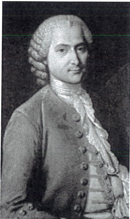
Jean Jacques Rousseau

'To find a form of association which may defend and protect with the whole force of the community the person and property of all its members and by means of which each, coalescing with all, may nevertheless obey only himself, and remain as free as before. Such is the fundamental problem of which the social contract furnishes the solution.'